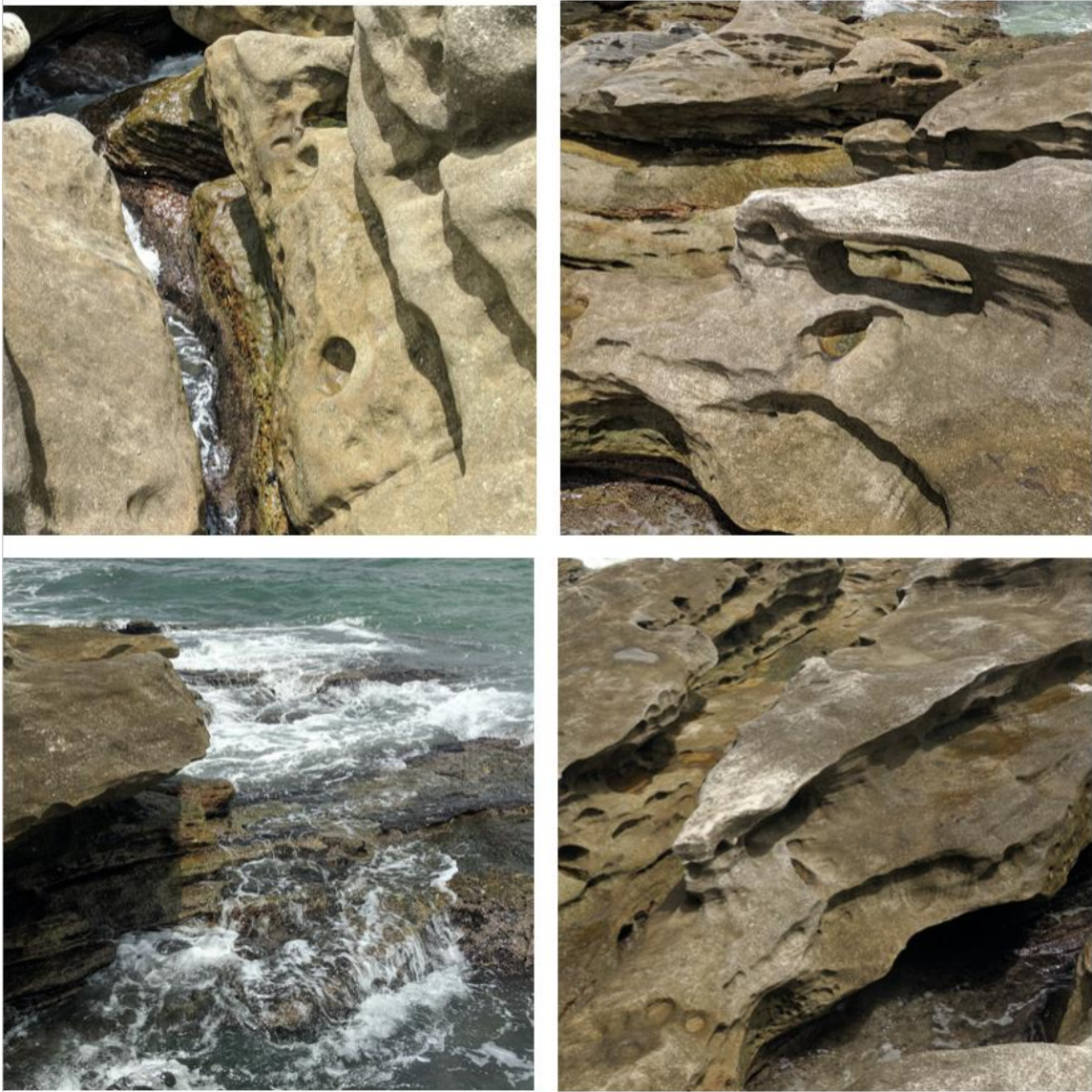
Figure 1 Primary study of rocks found at Conwy Morfa beach