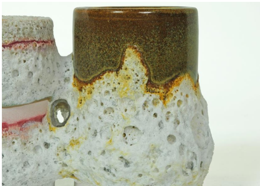
Figure 2 example of textural glaze